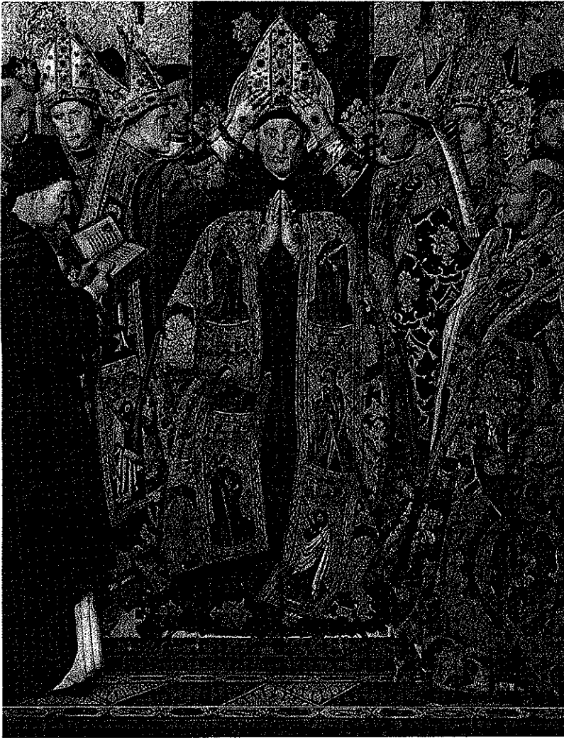
Ordination of Augustine as bishop by Jaime Huguet (1415-1492), Catalunya Art Museum, Barcelona, Spain.

1 The blessed old man Valerius rejoiced more than anyone at all this and thanked God for the special blessing that had been bestowed on him. Being only human, however, he began to fear that Augustine might be sought out and taken from him to be bishop in another Church that had lost its own. That indeed is precisely what would have happened if Valerius, on discovering such a plan, had not seen to it that Augustine withdrew to a secret location and thus prevented his being found by those who were looking for him.