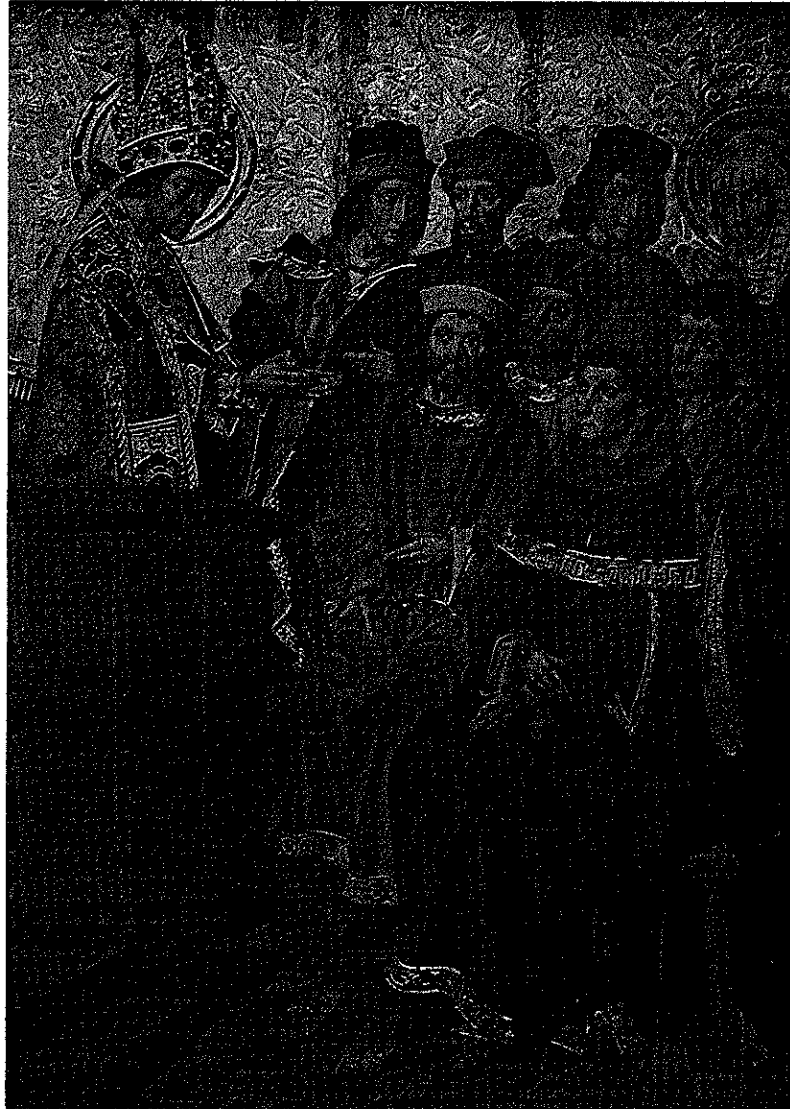
Augustine and Monica listen to the preaching of Ambrose, bishop of Milan, by Jaime Huguet (1415-1492), Catalunya Art Museum, Barcelona, Spain.

4 At one time, when he was a young man at Carthage, he had been led astray by the errors of the Manicheans. 9 He was therefore more attentive than others to anything that might be said for or against that heresy. 5 And it happened by the mercy of God the Liberator, who touched the heart of his priest, 10 that certain questions regarding God's law were answered in a manner contradicting that error. As a result Augustine was gradually instructed, and little by little that heresy was, by God's mercy, driven from his soul. In a short time he was confirmed in the Catholic faith and conceived so ardent a desire of advancing in religion that he received the divine sacrament at the approaching holy days of Easter. 11