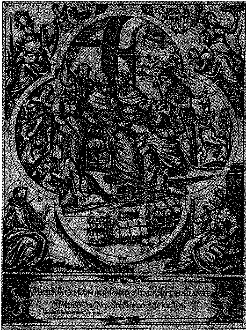
Augustine converts Firmus (Wandereisen Engravings, 1631).

5 A day or two later, if I remember correctly, a businessman named Firmus came and in our presence threw himself on his knees at the feet of holy Augustine, who was sitting in the monastery. The man was weeping as he asked the bishop to join the saints in interceding with the Lord for his, Firmus', sins. He confessed that he had been a Manichean and had lived in that sect for many years and that consequently he had wasted a very great deal of money on the Manicheans and their "Elect," as they are known. But, a few days earlier in the church, he had been converted by God's mercy and Augustine's arguments and had become a Catholic. 6 Venerable Augustine and the rest of us who were present